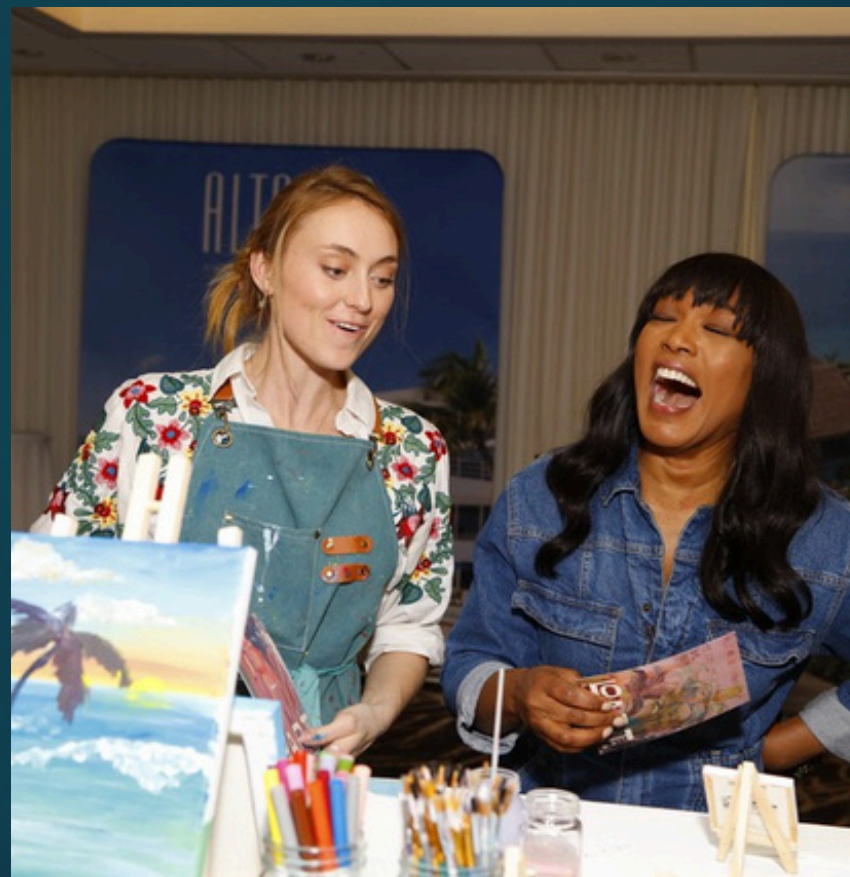
Angela Bassett Having a laugh