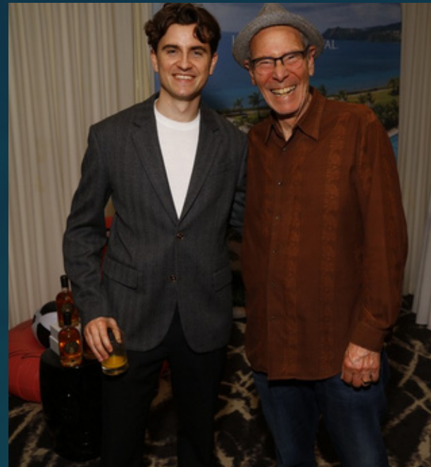
Stars of Ted Lasso & Jury Duty

The lounge is where they come to unwind and indulge in all things travel. Give them a taste of your brand, in an unhurried, chic, and elegant way.