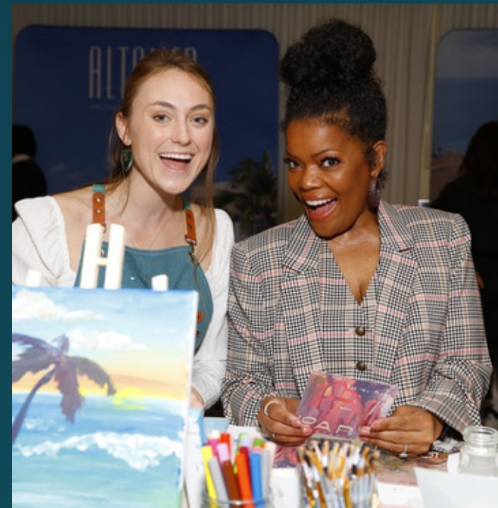
Yvette Nicole Brown Painting & Sipping