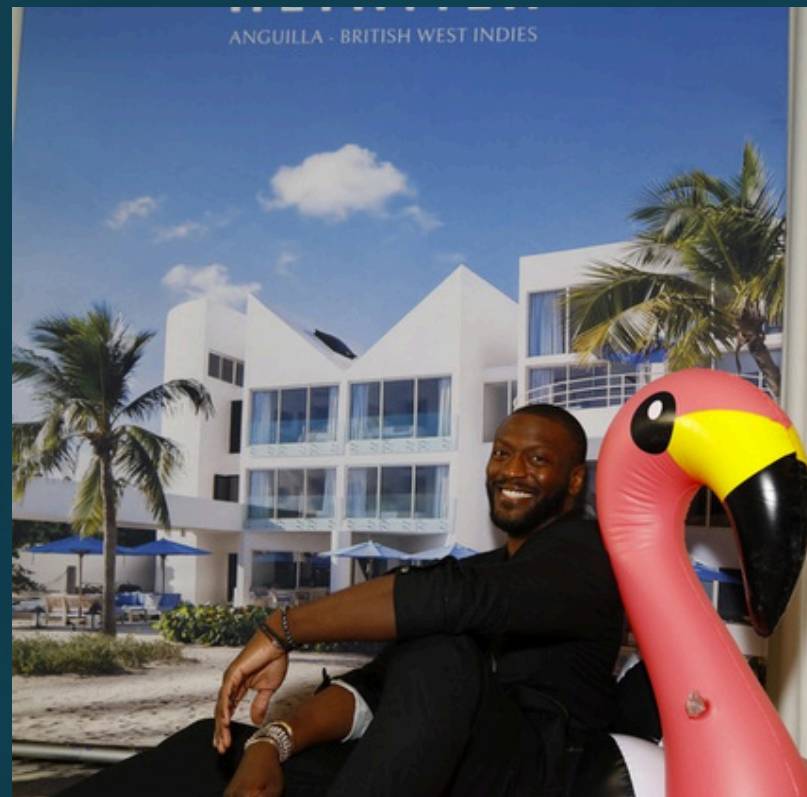
Aldis Hodge Chilling before Anguilla