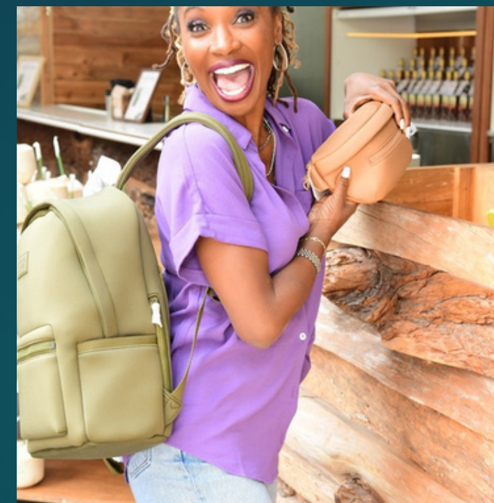
Shanola Hampton Loving her Dagne Dover gifts