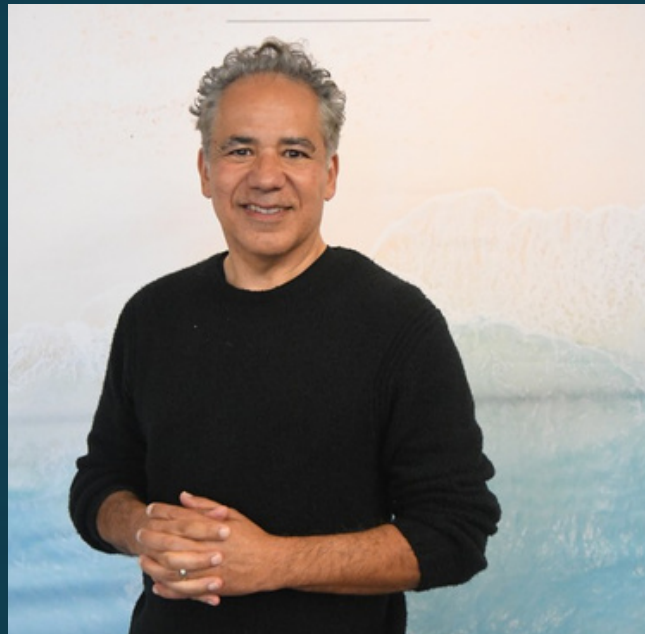
John Ortiz Being Iconic